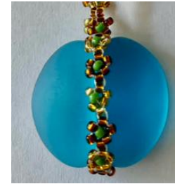
Entry 11: Sea Glass with Flowers