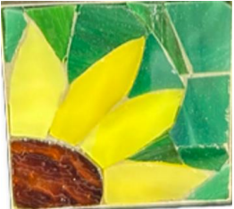
Entry 7: Sunflower Necklace