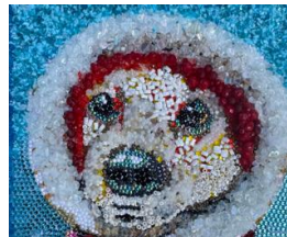
Entry 21: Winter Bling Blues