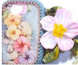
Entry 9: Summer Abundance