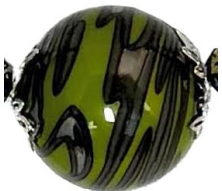
Entry 20: Garden Swirl