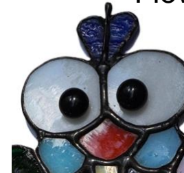
Entry 17: Happy Peacock