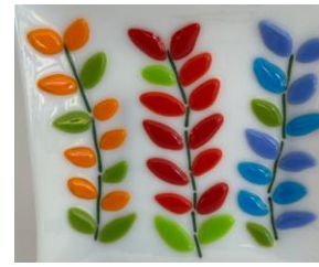
Entry 4: Twigs