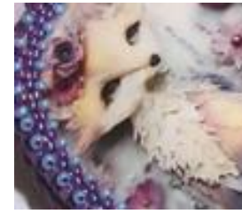
Entry 5: Fine Foxy Lady Fox