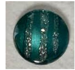
Entry 6: Cabochons