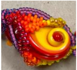
Entry 13: Dancing Flame