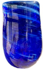
Entry 14: Care for a Pint?