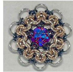
Entry 10: Hoodoo? You do!