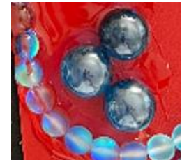
Entry 19: Bold with Glass