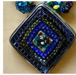
Entry 3: Rhapsody in Blue