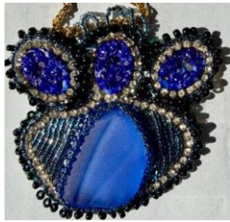
Entry 8: Sea Glass