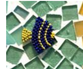
Entry 18: Montego Beach