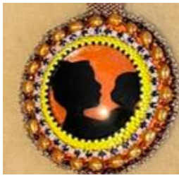
Entry 2: Mother & Child