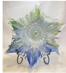
Entry 15: Everlasting Flower