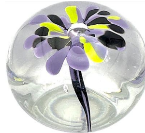
Entry 16: Paperweight